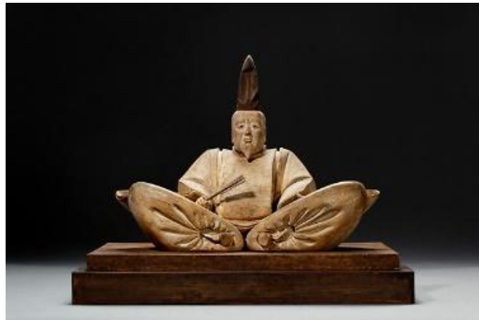
Sculpture of Uesugi Shigefusa (from a private collection). Photograph kindly provided by the Yonezawa City Uesugi Museum, Japan, and reproduced here with its permission as well as with that of the sculpture's owner.

The Uesugi family was established by a Kyoto nobleman, Kajūji Shigefusa (?-?), who was of Fujiwara descent and served at the imperial court as chamberlain ( kurōdo ) to Imperial Princess Shikikenmon'in (1197-1251) sometime in the thirteenth century. 2 Shigefusa's branch of the Kajūji family had a long tradition of providing chamberlains to members of the imperial family, with both his father, grandfather and a couple of more distant ancestors having held such positions, 3 and the tradition continued with his son, Uesugi Yorishige (?-?), Yorishige's three sons Norifusa (?-1336), Yorinari (1278/79-1346) and Shigeaki, 4 and Shigeaki's son Shigefuji. 5